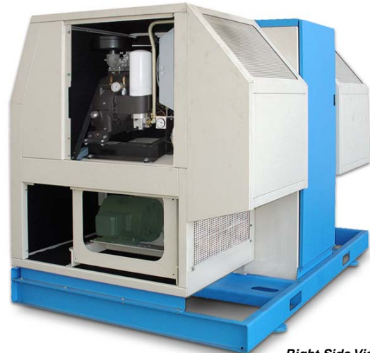
Right Side View: Feed Air Compressor Module Shown with Access Panels Removed